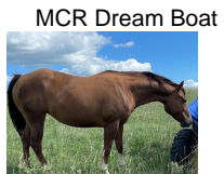
MCR Dream Boat

Date of Birth: 04/18/2020 Registration 1: 6041650